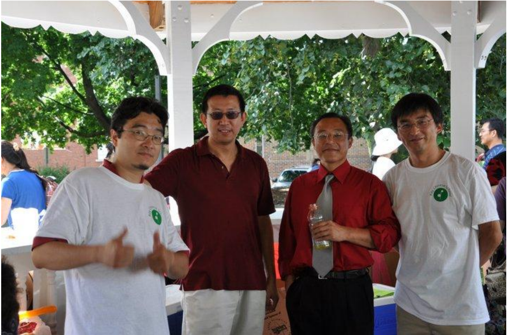
All Ready 马到成功