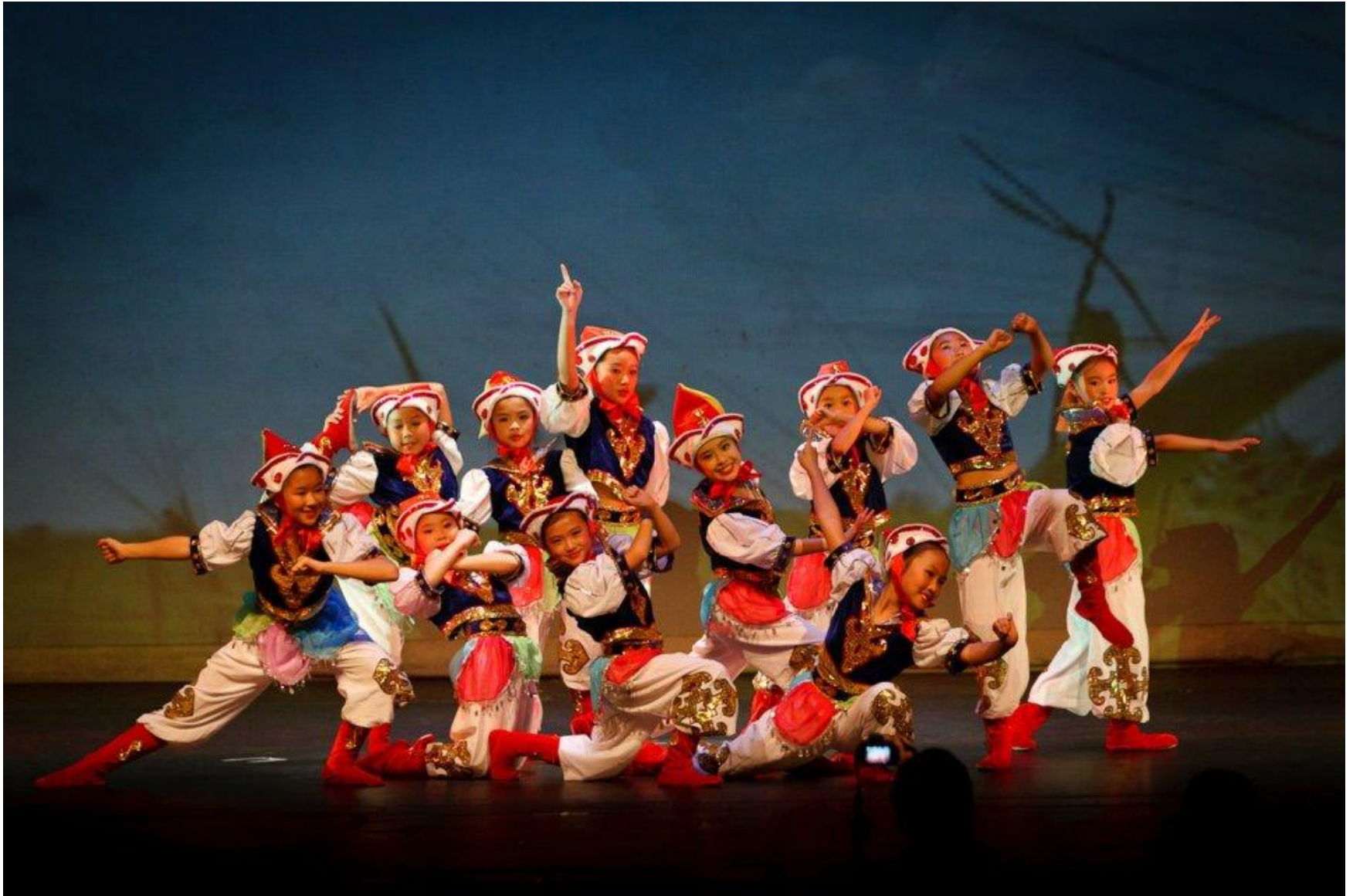
Little Ponies Galloping 小马奔腾