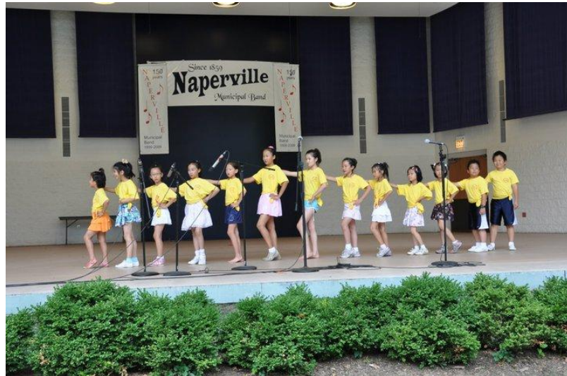
Summer Camp 夏令营