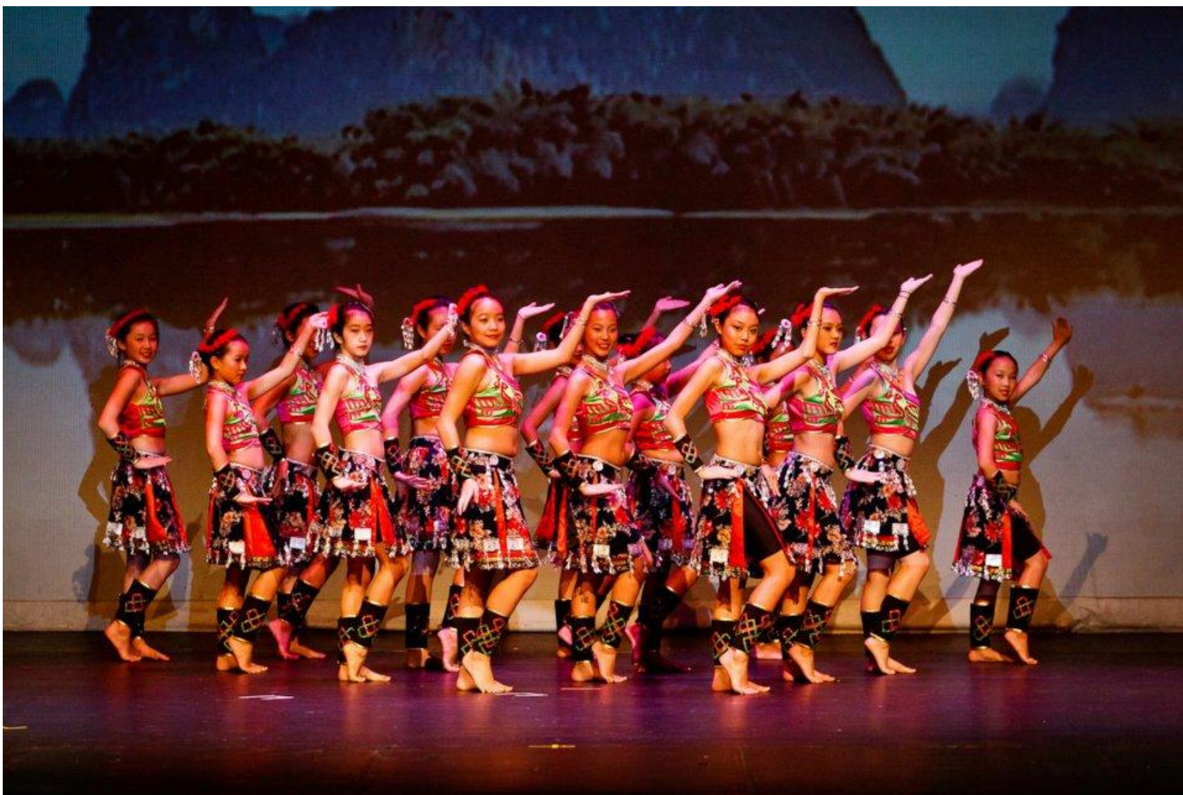
Walking between the Mountain and the Water 走在山水间