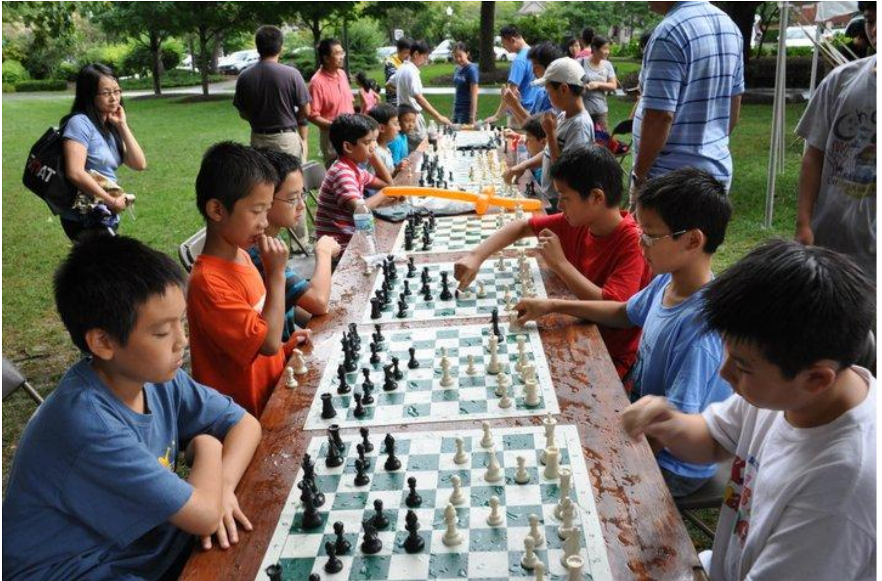
Chess Contest 国际象棋比赛