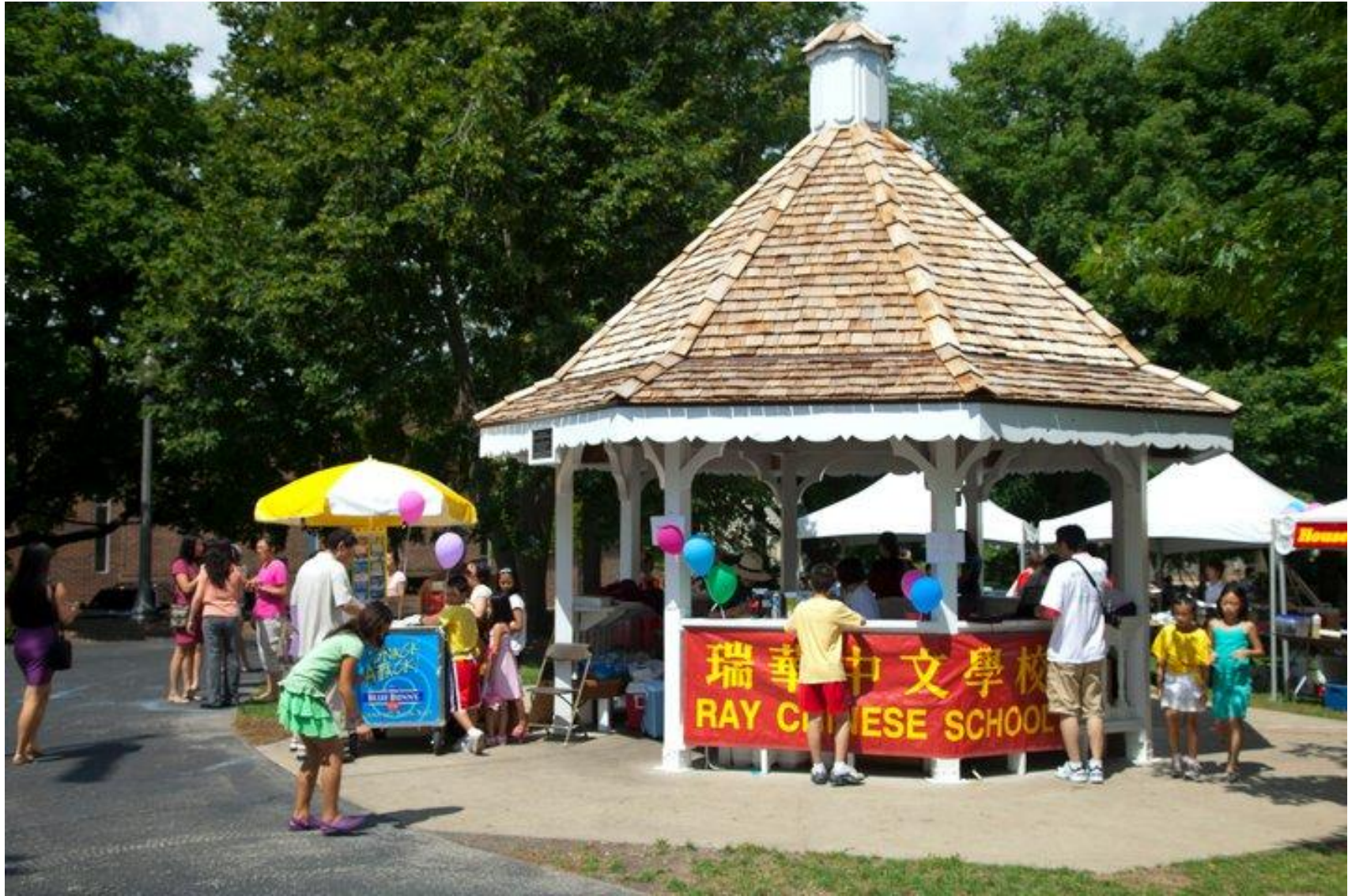
2011 Ray Chinese School Mid-Summer Chinese Culture Festival at Naperville 二〇一一年瑞华中文学校仲夏中国文化节