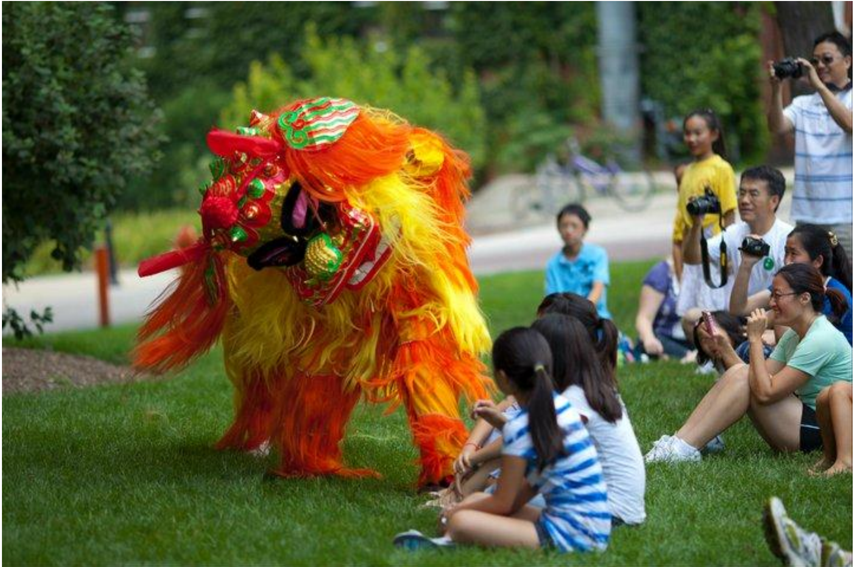
Lion Dance 狮子舞