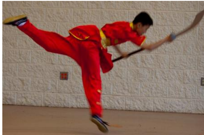
Chinese Martial Arts 中国武术