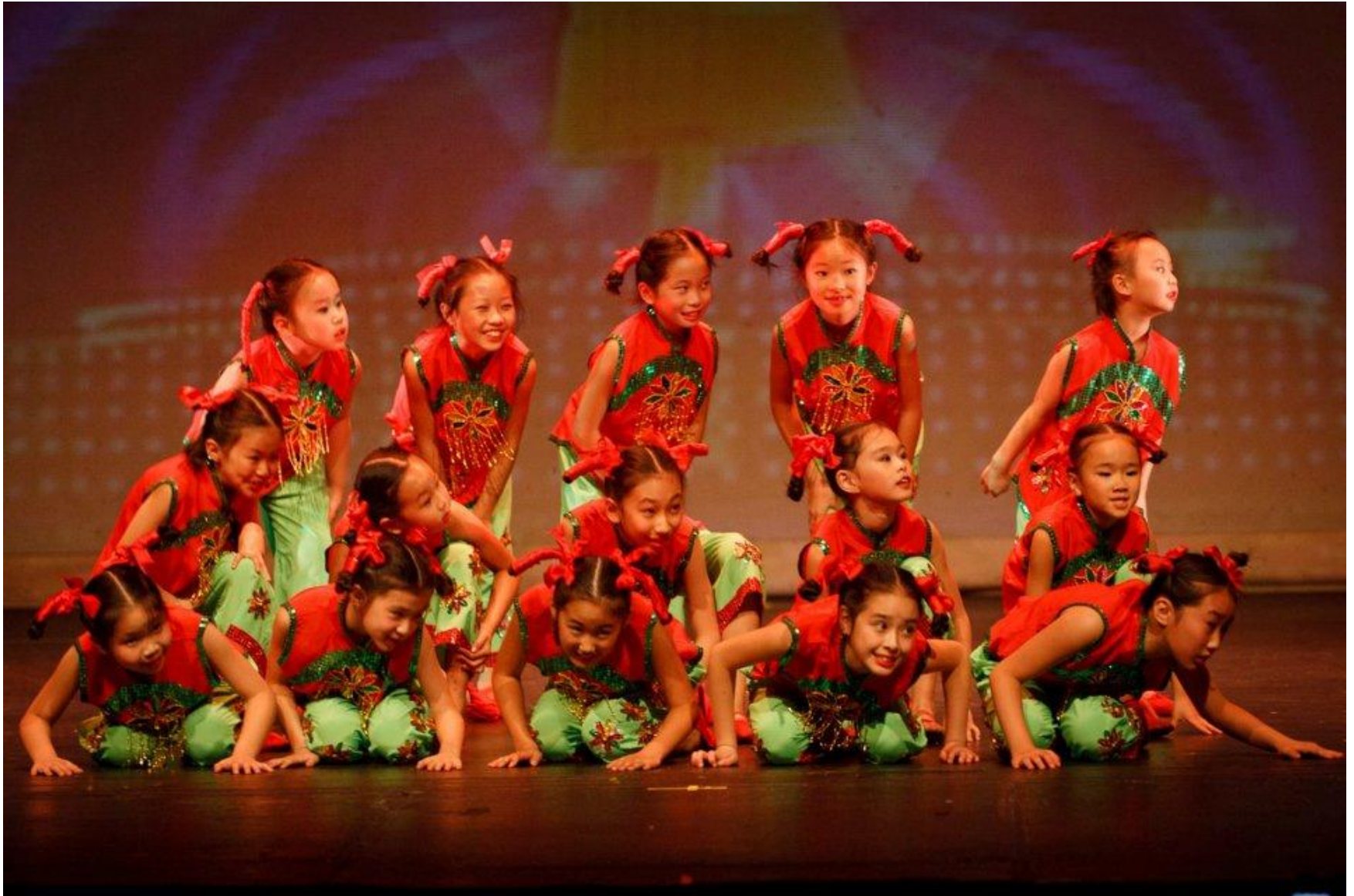
Happy Girls 喜妞妞