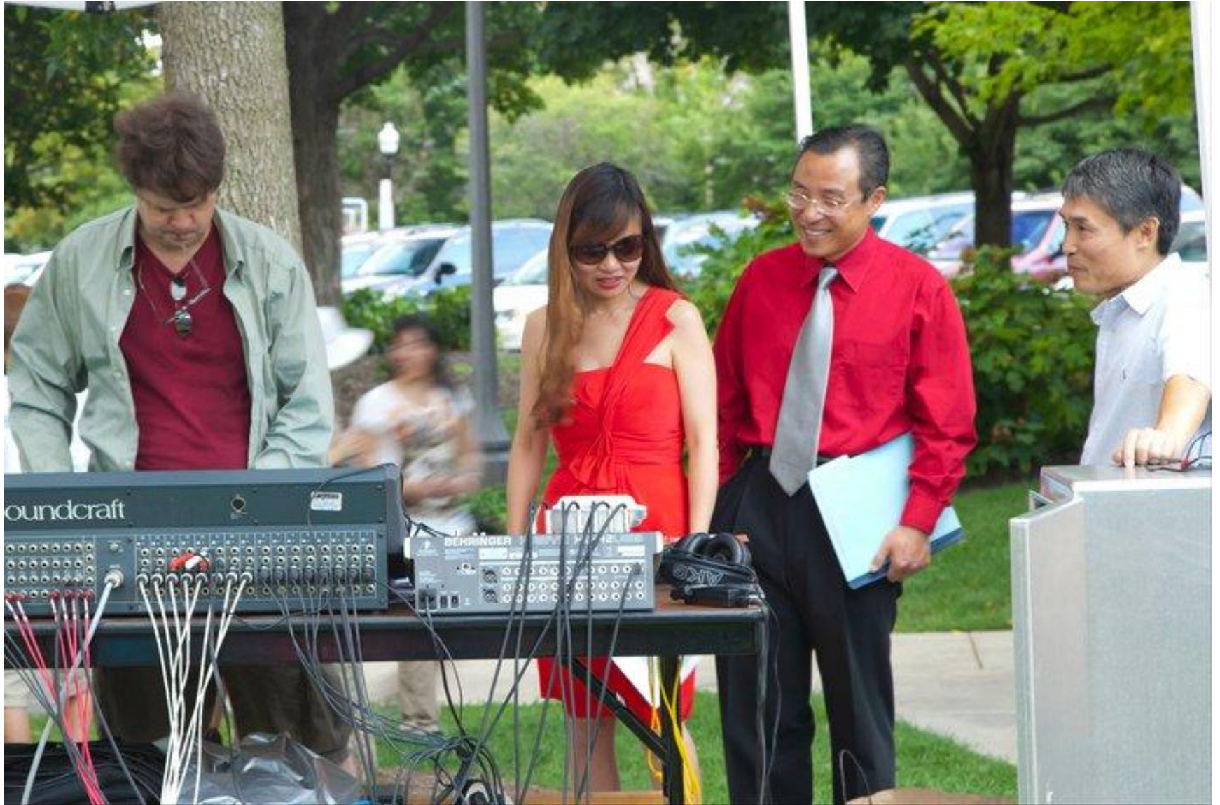
Performance Preparation 演出前的准备