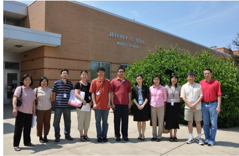
Summer School on Still Campus 暑期学校